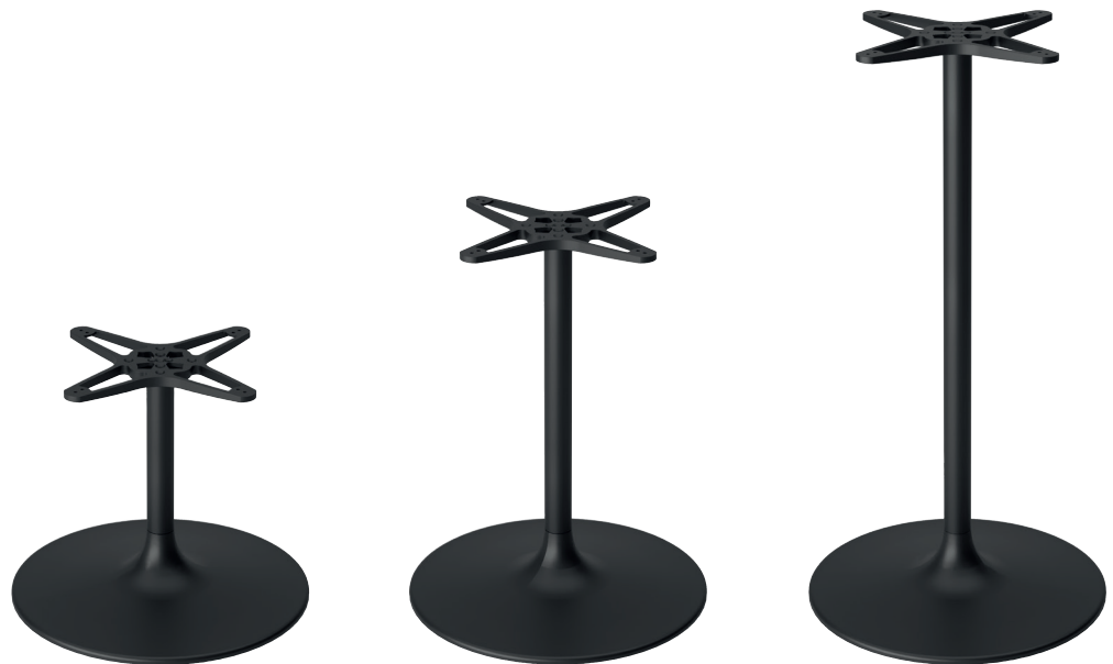
Table frame with round painted steel base and central column made of round tube. Table support cross made of die-cast aluminium. Also suitable for outdoor use on request.

Struttura per tavolo a base tonda in acciaio verniciato e colonna centrale in tubo tondo. Crociera per supporto tavolo in alluminio pressofuso. Adatto anche all'utilizzo per esterno su richiesta.