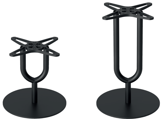
Table frame with round base and columns made of tubular steel, and die-cast aluminium cross, whose shape is reminiscent of an acoustic instrument. The structure can be combined with table tops of different sizes and finishes.

Struttura per tavolo con base tonda e colonne in tubo d'acciaio e crociera in alluminio pressofuso, la cui forma ricorda lo strumento acustico. La struttura è abbinabile a piani di diverse dimensioni e finiture.