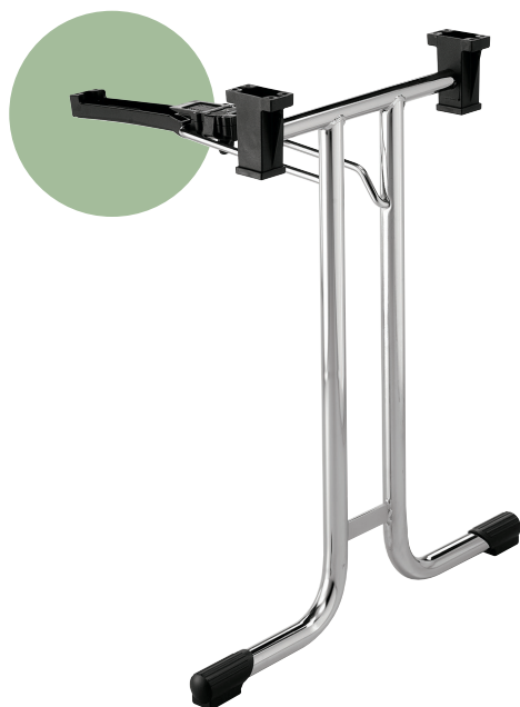
bloccaggio in plastica plastic leg locks