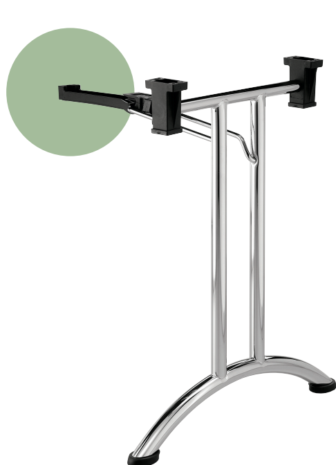
bloccaggio in plastica plastic leg locks