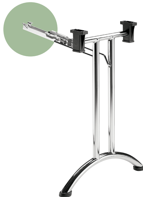
bloccaggio in ferro metal leg locks