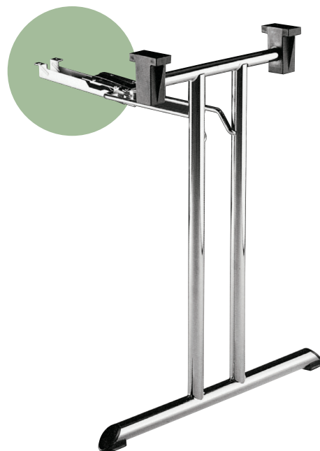
bloccaggio in ferro metal leg locks