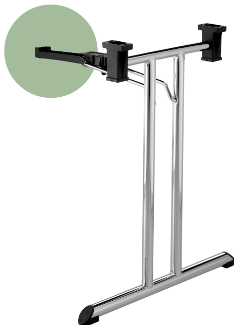
bloccaggio in plastica plastic leg locks